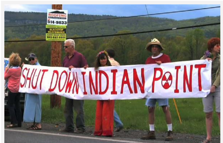
A still from 'The Atomic States of America,' a film playing at the Uranium Film Festival in Albuquerque and Window Rock.